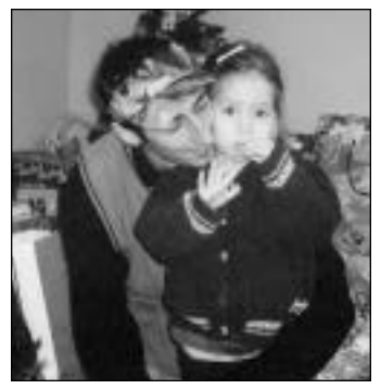
A young father and the apple of his eye at the Christmas party we threw for our young parents and their children

young mothers continued to work hard and found their wings – giving themselves and their children a real chance at a better life. Regardless of whether they've decided to go back to school, end an abusive relationship or start therapy, these young women are looking to the future and are eager to take advantage of the opportunities available to them.